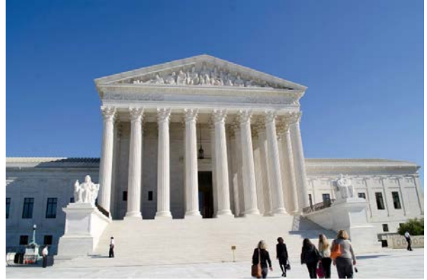
Student Paralegals Approaching the U.S. Supreme Court

Last year, BUSPA decided to visit Washington D.C. as a group, as many of our paralegals had never visited D.C., or even flown on an airplane. Student paralegals provide their own transportation to D.C. but BUSPA paid for students' lodging, meals, tours, through fundraising efforts and contributions by faculty, friends, and family. In October 2017, 8 students, and several instructors made the journey for 3 days. The highlight was attending a Supreme Court oral argument, and meeting with one of the Justices!